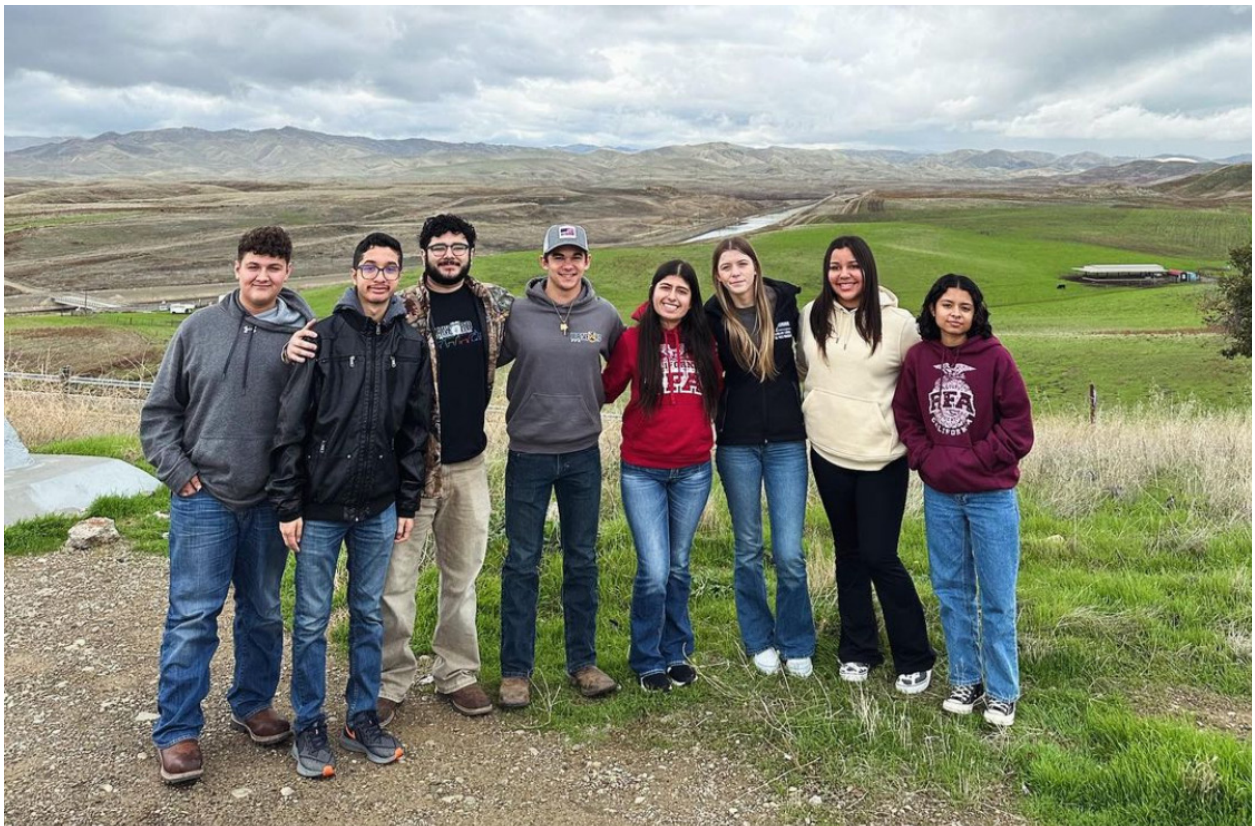
Hanford FFA Water Contest Team